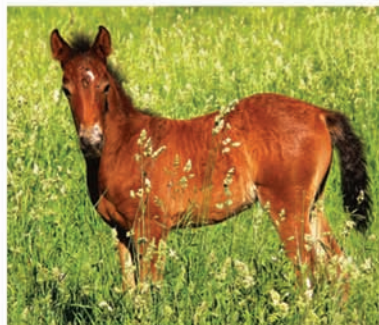
Mythos Lambert Unity raf (Westrek Arnett x Ausable Classic Hamna)

Proudly carrying on the Lambert tradition with two crosses to Criterion in four generations.