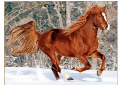
Switzerland photos © S. Nadja & Snake Viking