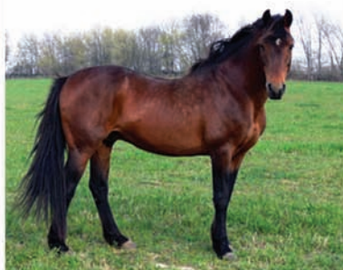
Westrek Arnett #99102 (Stone's Check Mate x Bonita Kellogg)