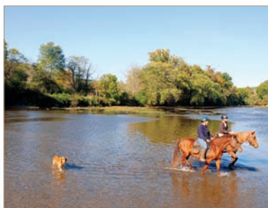
Quietude Cara Mia